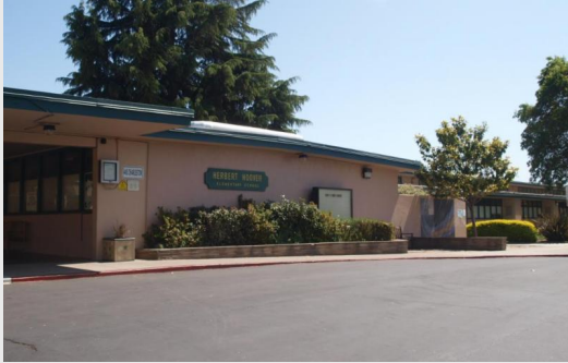
Hoover Elementary School

Each spring, Hoover Elementary hosts a school wide Invention Convention. The event is designed to encourage the development of important science skills and give students opportunities to solve problems, think creatively, investigate, and work with data. Students from all grade levels work independently or in teams to invent new products or processes and/or investigate new hypotheses. This year's convention will take place in the MP Room on Tuesday and Wednesday, March 7th & 8th with a Family Night on the 7th from 6-8pm. Visitors across the district are invited to come by and check out the amazing inventions!