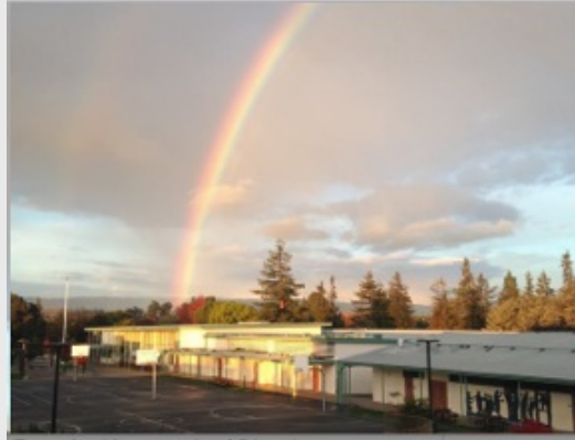
JLS Middle School

The month of January at JLS will be informational and action packed!